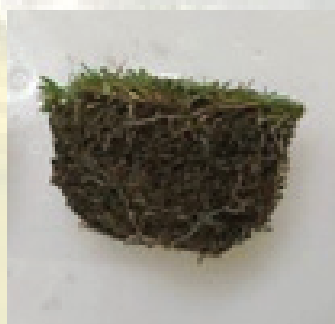
Initial stage before treatment