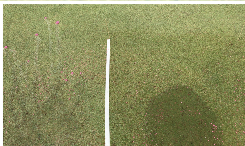
UNTREATED REPELLENCY OCCURS / RUN-OFF